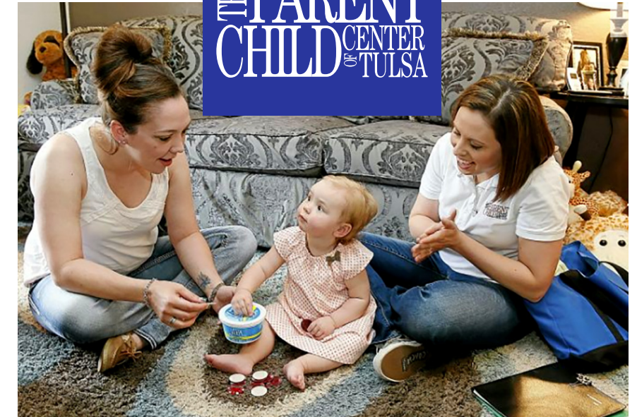
Family Support, Photo credit: Tulsa World