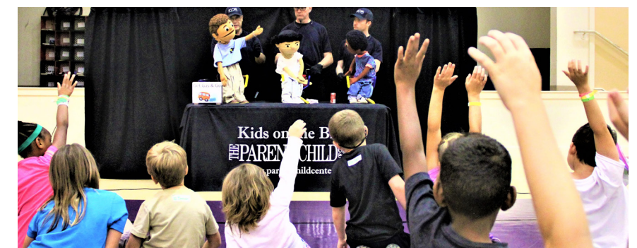
Kids on the Block

Preventing child abuse and neglect through education, treatment, and advocacy.