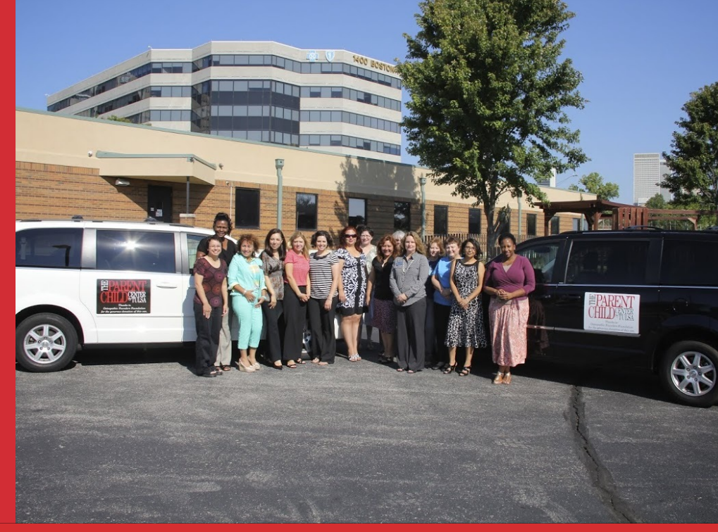
ABOVE: New minivans help PCCT staff serve clients thanks to Osteopathic Founders Foundation.

BELOW: PCCT staff at annual staff retreat.