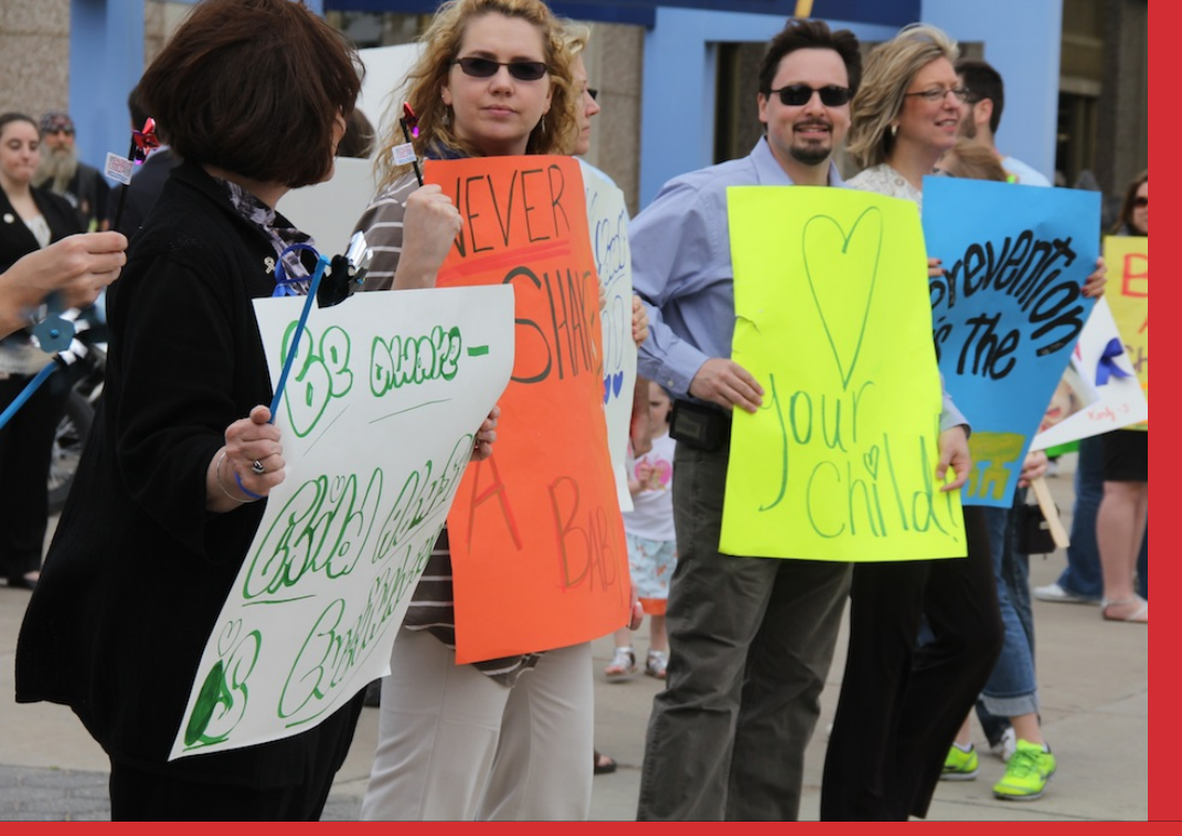
ABOVE: PCCT staff participates in the March Against Child Abuse.