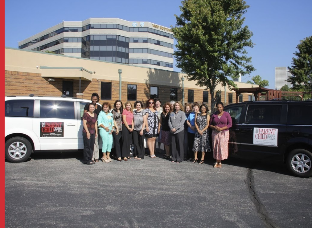
ABOVE: New minivans help PCCT staff serve clients thanks to Osteopathic Founders Foundation.