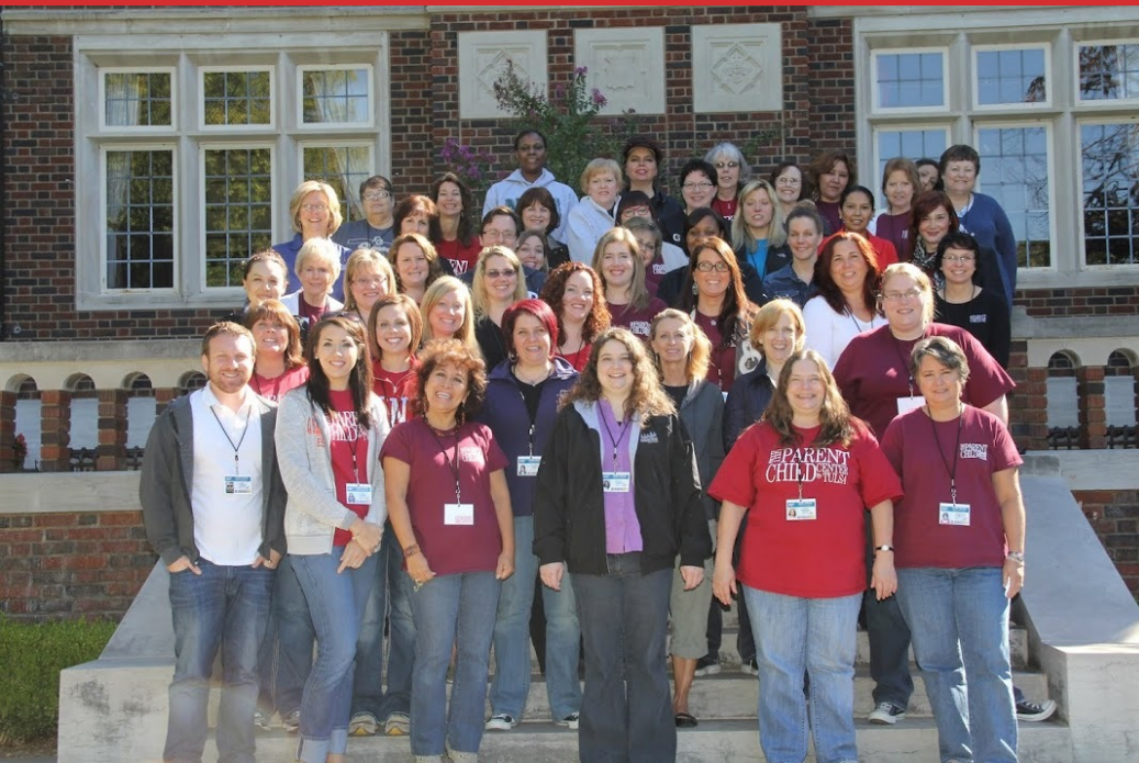
BELOW: PCCT staff at annual staff retreat.