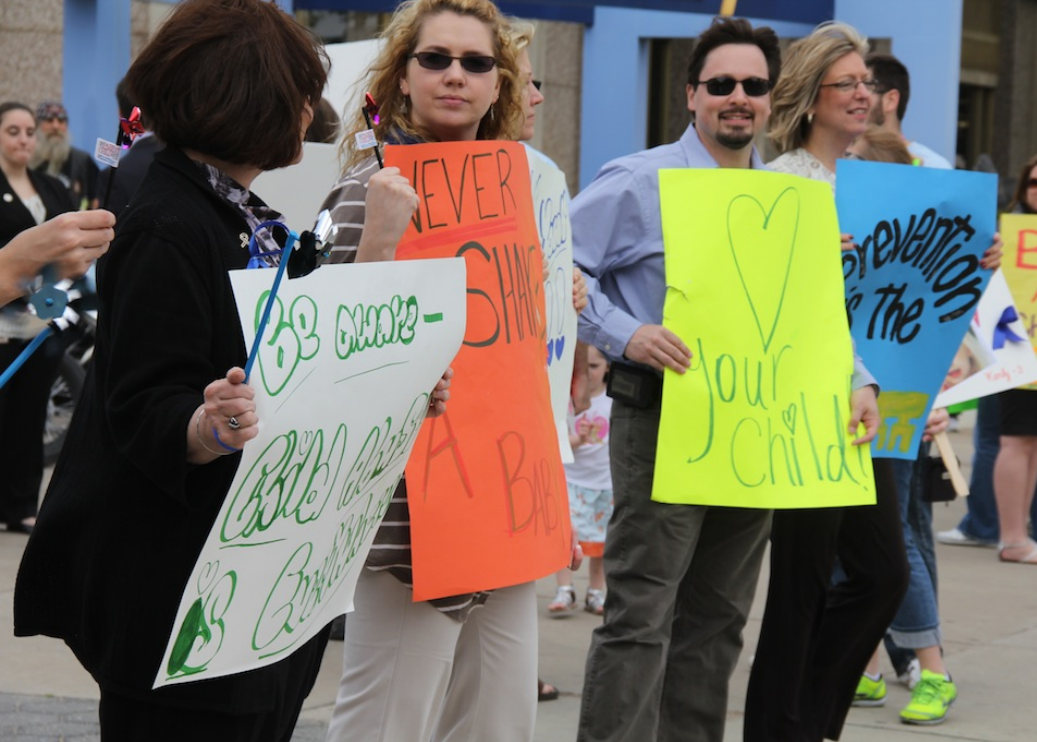
ABOVE: PCCT staff participates in the March Against Child Abuse.