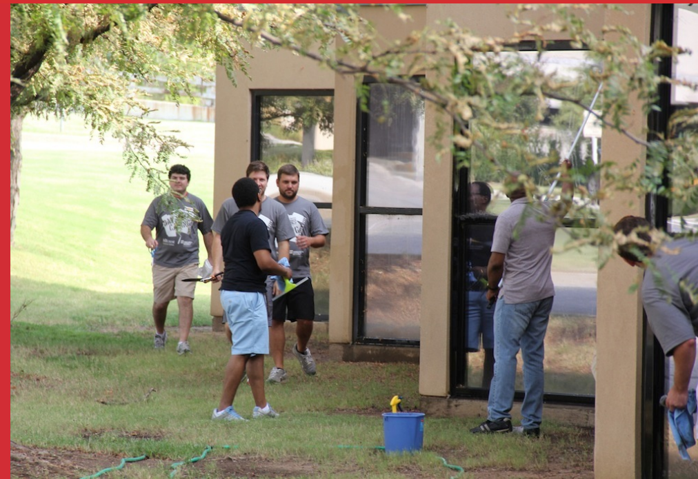
BELOW: Volunteers from EY wash windows at the PCCT campus on the Tulsa Area United Way Day of Caring.